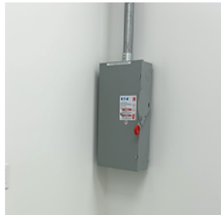
240 Vac (30 A-40A)